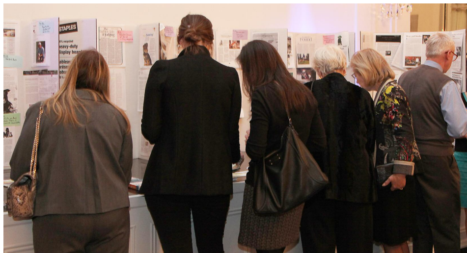
Entries were put on display for viewing by the awards banquet attendees.