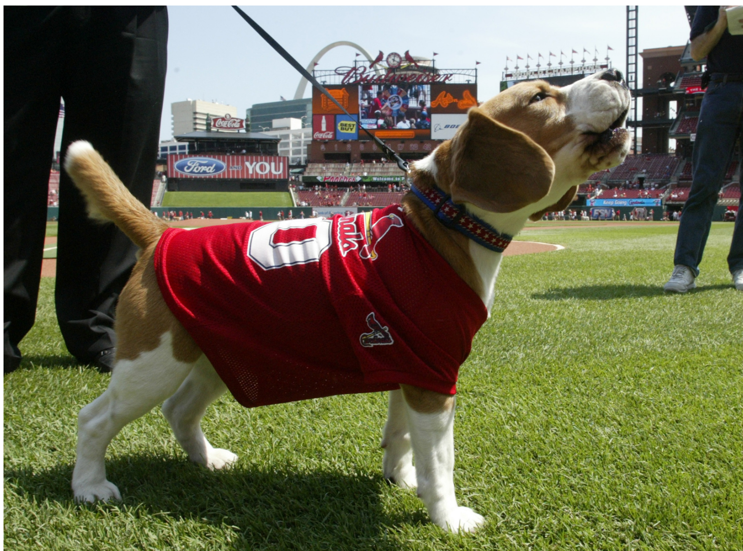
2008 Westminster Best in Show winner, Uno, a three-year-old Beagle, howls to the fans, before the baseball game between the Atlanta Braves and the St. Louis Cardinals at the 4th Annual Purina Pooches in the Ballpark event, Sunday, August 24, 2008, in St. Louis. Nearly 150 dogs and their owners cheered on the Cardinals from a special section of the Stadium.

This Month: Member Survey Web Site Launch Forum Update