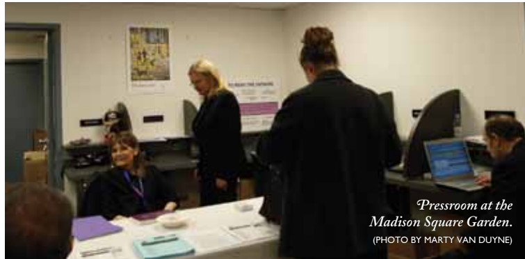
Pressroom at the Madison Square Garden.