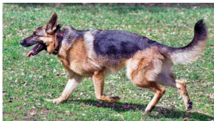
The American Kennel Club calls the German Shepherd Dog "courageous, confident, smart." GSDs are large dogs, largely considered the best dog for police work and training. The breed was developed in the late 1800s in Germany as a herding dog.

Aggression to strangers and barking at strange sounds is probably fear-based aggression, a problem that is becoming common in German Shepherds. ■