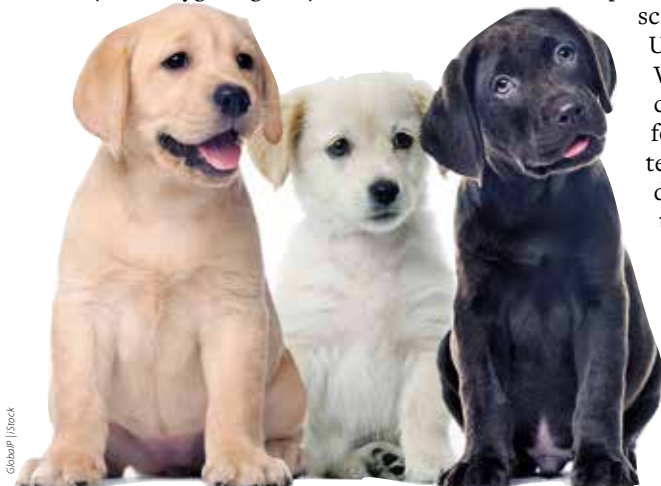
In Labradors, completely different genes decide dark vs. yellow coats.

"I would recommend a full genetic panel. Generally, the costs are on par or even less expensive than doing single-gene tests for all the breed-relevant health and trait conditions. Screening for all known genetic conditions also allows breeders to discover new mutations