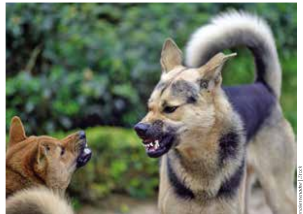
A dog showing teeth with a hard eye and curved tail (whether wagging or not) is angry and considering an attack.