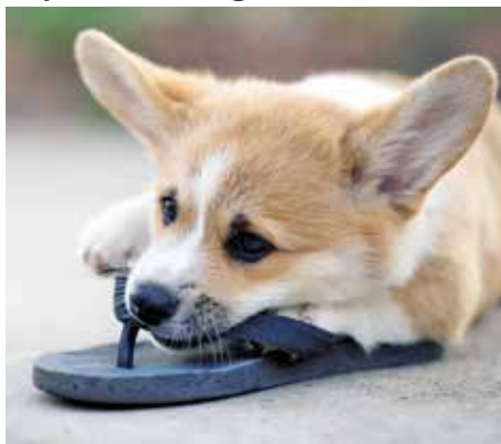
When your previously perfect puppy unexpectedly reverts to old behaviors, that might be puppy adolescence.

Think like a puppy as you walk through your house. What things look like fun to grab or chew on? Move