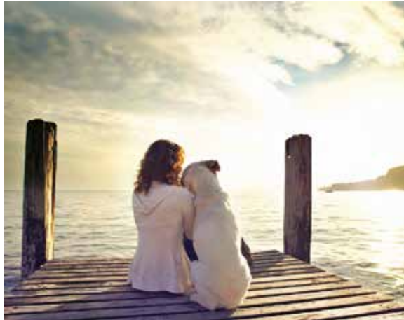
Interacting with our dog increases brain activity.

If fights become a regular occurrence, or if they escalate in intensity, consult with a veterinary behaviorist to come up with a behavioral modification plan to help your dog. ■