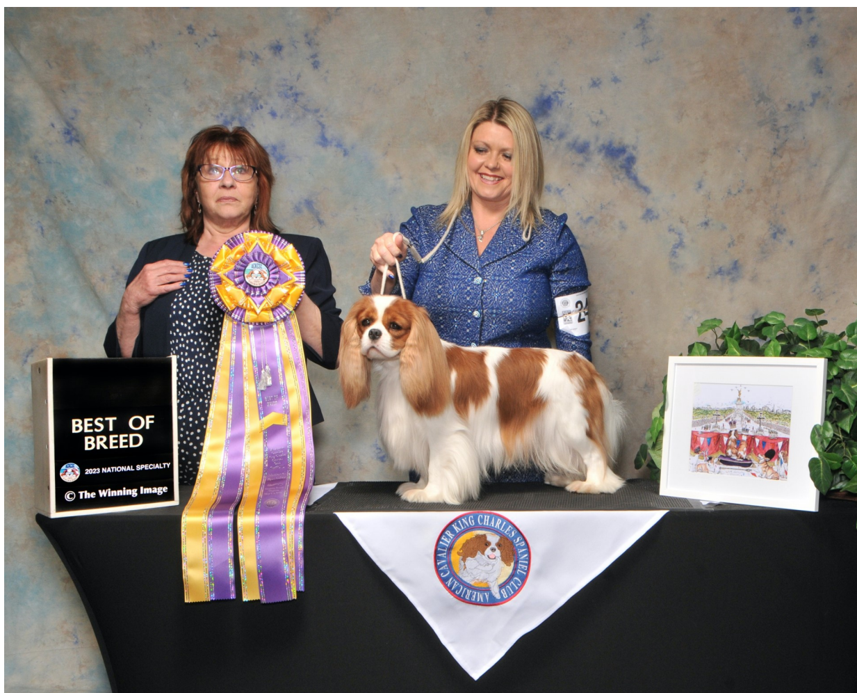
GCHB CH Sheeba Ladies Man 2023 ACKCSC National Specialty BOB