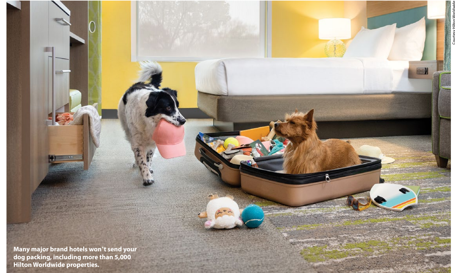
Many major brand hotels won't send your dog packing, including more than 5,000 Hilton Worldwide properties.