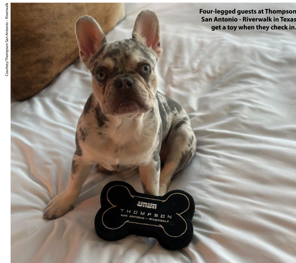
Four-legged guests at Thompson San Antonio - Riverwalk in Texas get a toy when they check in.

The Chesapeake Bay area also throws dogs a bone. "We have several spacious lawns and pet-friendly trails that run along the Choptank