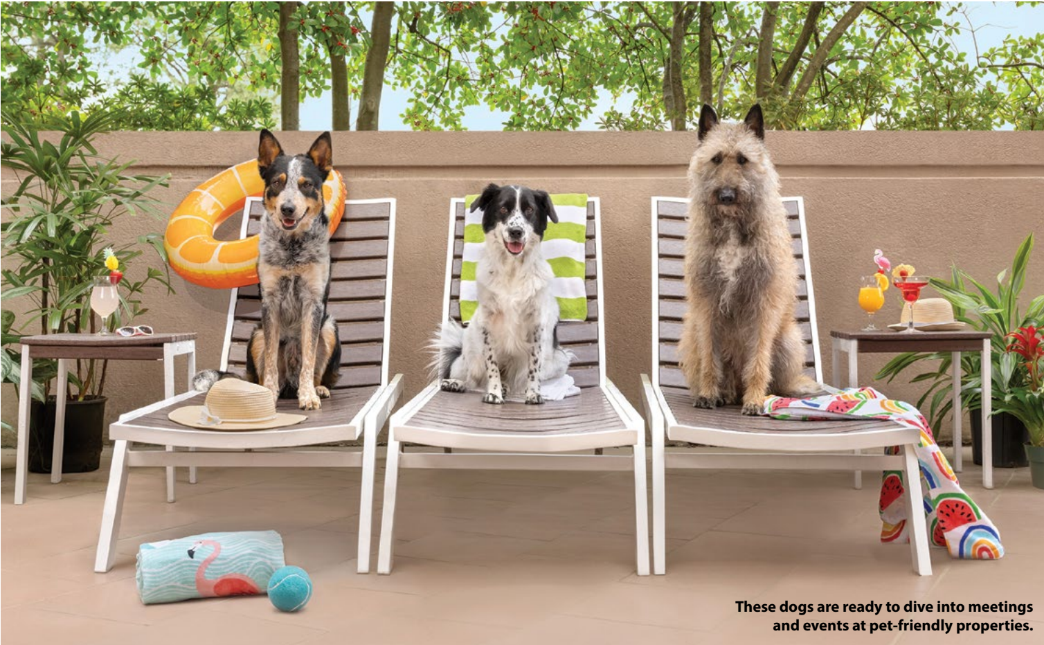
These dogs are ready to dive into meetings and events at pet-friendly properties.