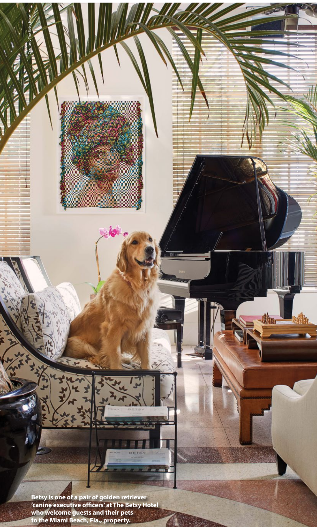
Betsy is one of a pair of golden retriever 'canine executive officers' at The Betsy Hotel who welcome guests and their pets to the Miami Beach, Fla., property.

with a dog towel and dog mat. Crates are available, and the hotel can arrange dog-walking services with advance notice. Special dog-related events take place year-round, including Mr. Pickles Howl-o-ween Costume Party.