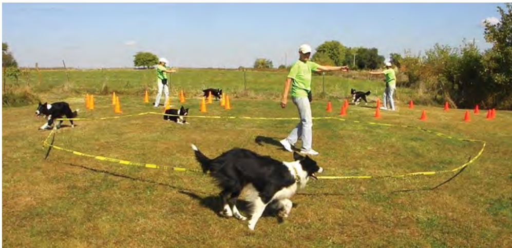
Sir playing an advanced enrichment game.

Then again, maybe it was the gal who asked a question during one of my webinars. Let's call her Laura and her dog Sam, which are not their real names. "I have a dog", she began, "who is extremely distractable. He listens well in my house and is pretty good in any indoor setting, but ... as soon as we go outside he becomes totally distracted. Lose your mind distracted. He cannot sit or down, although he is proficient in doing both when inside. There is no way I could ever let him off-lead outside as I would have no hope of recalling him. I don't think he can even hear me in this situation, much less respond. What can I do?" she pleaded.