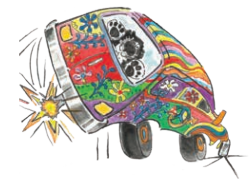
Sydney's Adventures in Aubieland