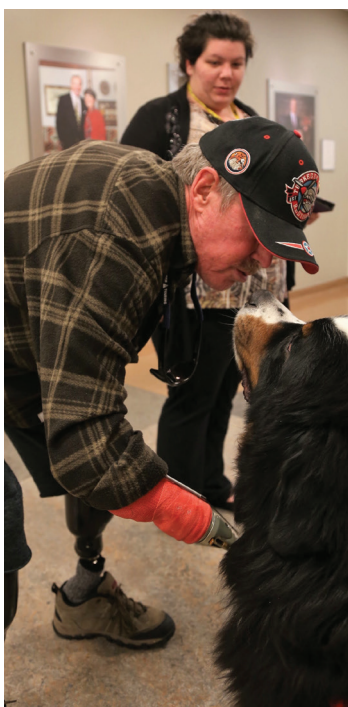
▲ Benno (BG# 86405) greets all manner of people who stop for a quick pet on his way to his shift at the University of Utah Nielsen Rehabilitation Hospital.

Another time, as Benno and I walked through a hospital lobby, a woman beckoned us to come to her. She told