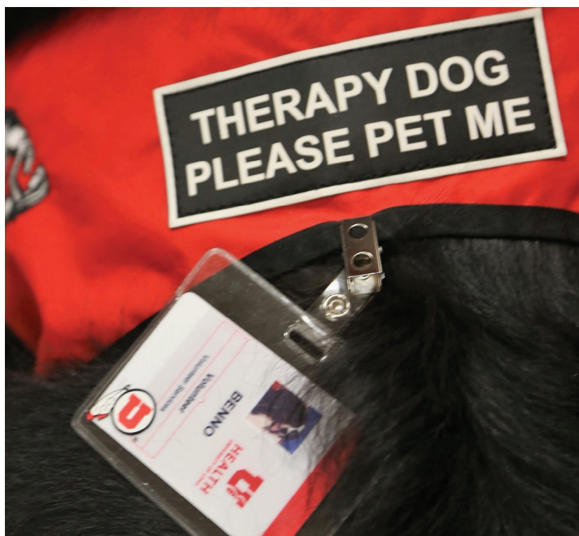
▲ ThornCreeks Mr. Bennett, "Benno," (BG# 86405). The notice on Benno's vest ensures people that he is not a working dog and welcomes being touched.